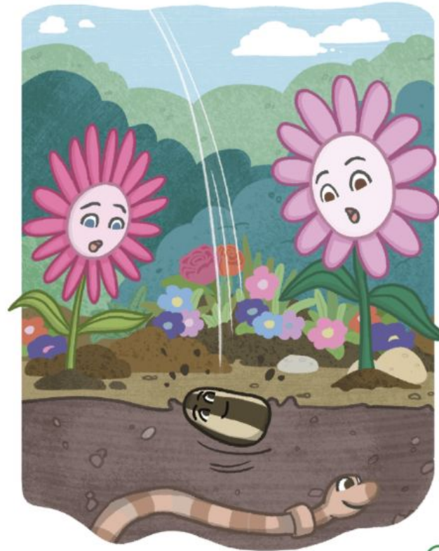
She sinks into some soil.