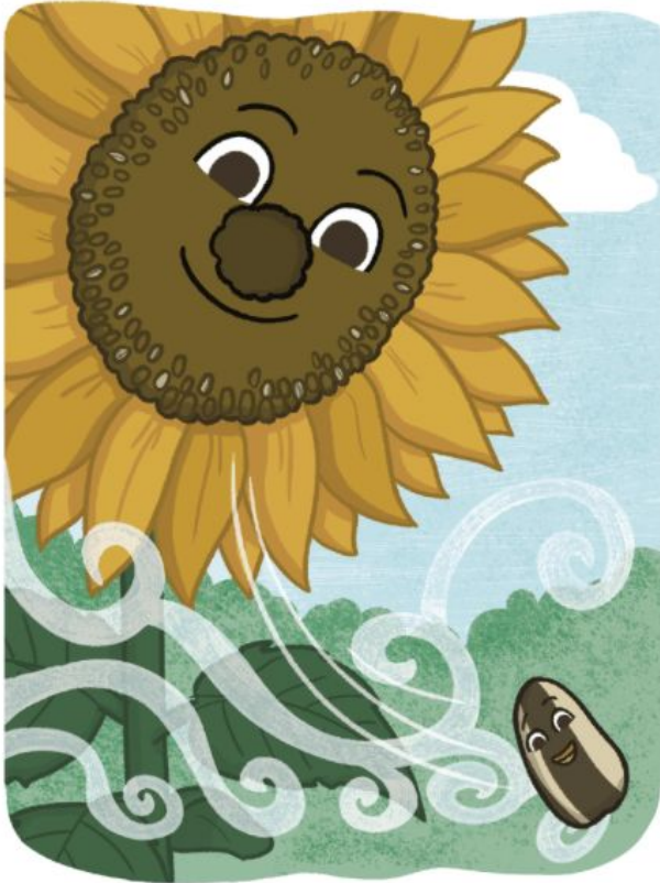
Sal the seed drops down.